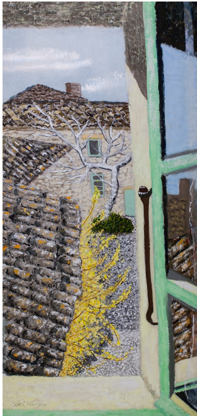
View through the French Window