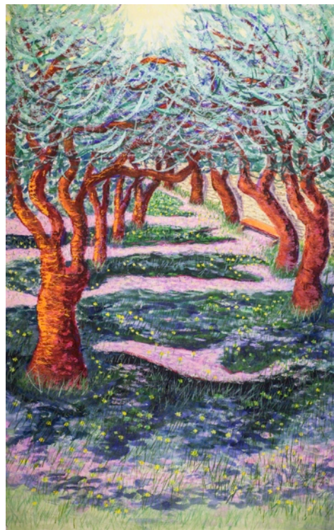
The Olive Grove 2017

Returning to my studio in Sydney, I drew the image several times, then layered the paint on to one of my favourite mediums, handmade rice paper. As the paper was too large for my table, I painted on the floor, using the chalkiness of gouache combined with the luminosity of French inks.